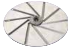
Special chives 3-blade-cutting-knife